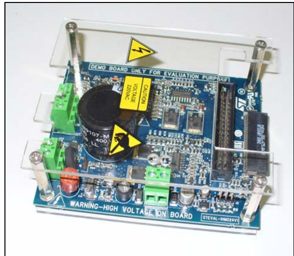
M3 core-based STM32F10x 128 Kb microcontrollers.

Additionally, using a dedicated connector, the board can be interfaced with the STM3210B-EVAL evaluation board, which is an evaluation platform for STMicroelectronics' ARM TM Cortex-