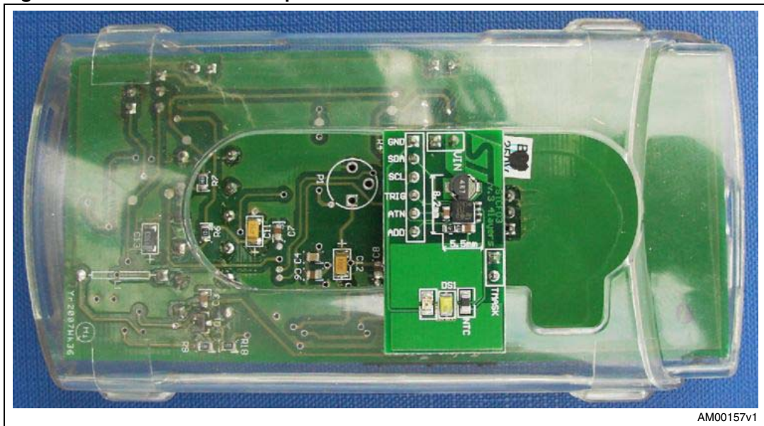
Figure 1. STEVAL-TLL005V1 power flash demonstration board

The STEVAL-TLL005V1 consists of both a motherboard and a daughterboard connected together (STEVAL-TLL004V1 for the daughterboard only).